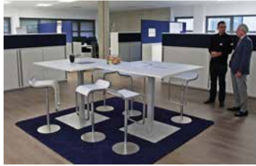
The new office building offers modern work spaces as well as conference and training rooms

technology park. It was inaugurated in 2009 and had to be enlarged with new offices and warehouse facilities in 2011 and 2012.