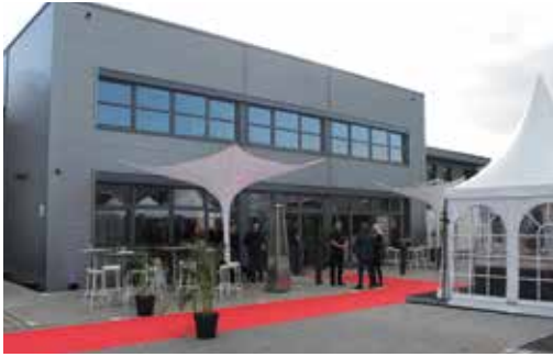
Plans for the enlargement of the new office building are already made